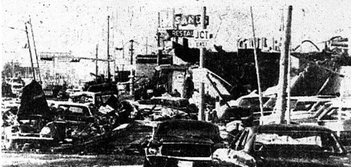
Tornado-wrecked cars litter the street near destroyed. There were 20 known dead and post-tornado Lubbock, Tex., following twister that sibly as many as 500 injured. Damages estimated the city Monday night. Business houses mates have ranged up to $200 million.

The meeting with the Academic Senate and other groups was still in progress at noon today.